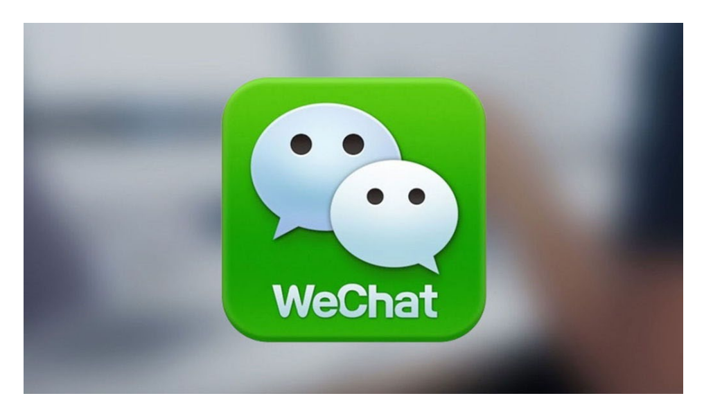
A critical difference between WeChat and its domestic Chinese counterpart, Weixin, is that accounts registered in China are subject to direct censorship

WeChat censorship may take the form of personal messages not being delivered by the app, the blocking of individual or official accounts, the closure of group chats, and the inability to publish content, among other types of censure. To avoid this, news publishers often omit certain content on their WOAs lest it triggers WeChat's keyword censorship.<sup>25</sup>