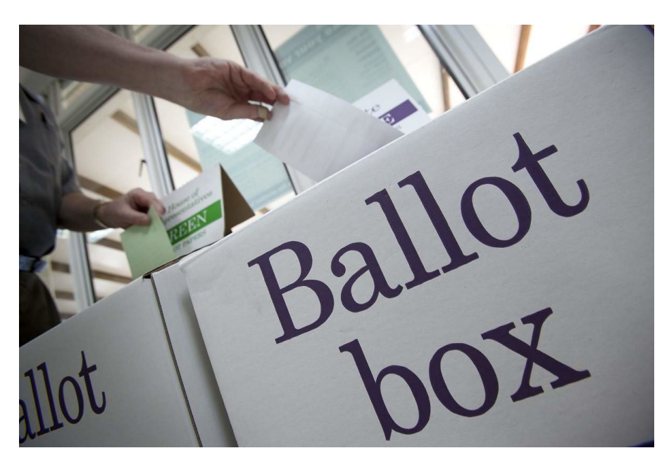
Australia's preferential and compulsory voting system is complex, especially for immigrants from non-English speaking backgrounds

Interviews with current NSW councillors and former candidates who are on WeChat reveal that the dichotomy of democratic values versus WeChat censorship is over-simplistic. While WeChat is not a friendly space for free speech, it is a space where a large population of first-generation Chinese immigrants — often unreached by mainstream social media or English-language websites — receive information crucial to their civic participation and welfare in Australia.