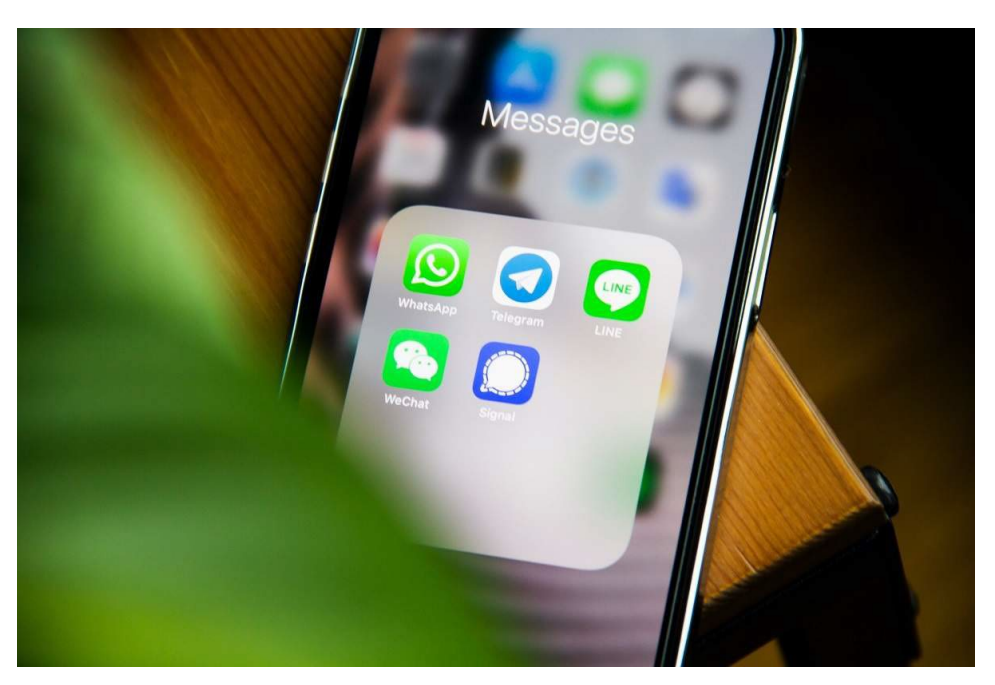
WeChat, the world's most popular Chinese-language social media app, emerged as a key political battleground in the last two Australian federal elections

Owned by the Chinese tech giant Tencent and known for its state-directed content censorship,<sup>4</sup> WeChat has triggered alarm in Australia's public debate about foreign influence and censorship. In early 2022, an ownership dispute relating to the former prime minister Scott Morrison's WeChat official account (WOA) rekindled calls for a wholesale "WeChat boycott" in Australia.<sup>5</sup> According to some analysts, WeChat is antithetical to democratic values and freedom. For example, China scholar John Fitzgerald argues that "WeChat was not designed to work in a democracy, and a democracy can't work with WeChat ... Xi [Jinping's] scissors are at work clipping away wherever people are messaging."