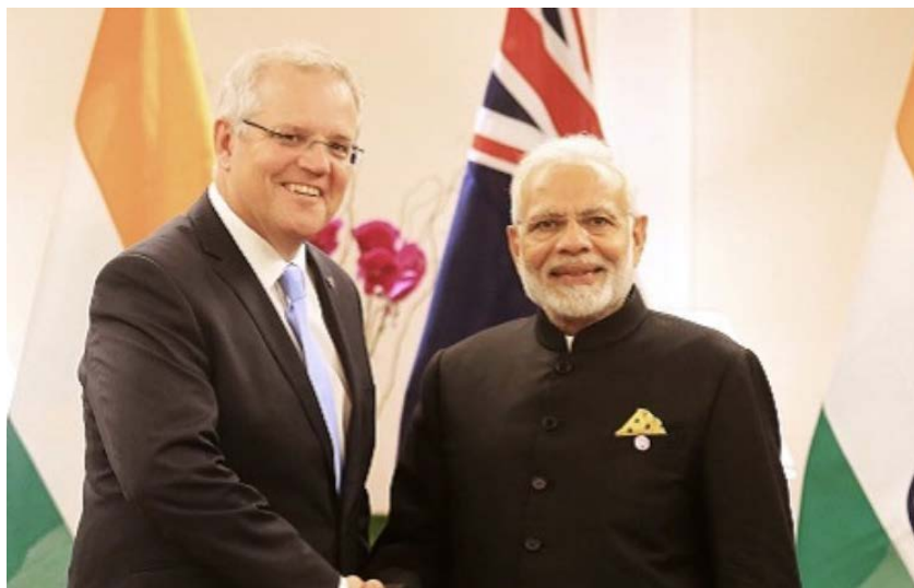
Australian Prime Minister Scott Morrison with Indian Prime Minister Narendra Modi at 2018 ASEAN Summit Singapore.

Military-to-military contacts have also increased. Senior Australian military officers take part in the year-long course at the National Defence College in New Delhi, as well as at the Defence Services Staff College (DSSC) in Tamil Nadu, and the Indian Navy's National Institute of Hydrography. The number of Indian participants in the Australian Command and Staff College in Canberra has been increased from two to three, along with an Indian student at the Australian Defence College in Canberra. Australia's National Security College has also made a concerted bid to attract Indian public servants for courses. Cadet exchanges have become more routine.