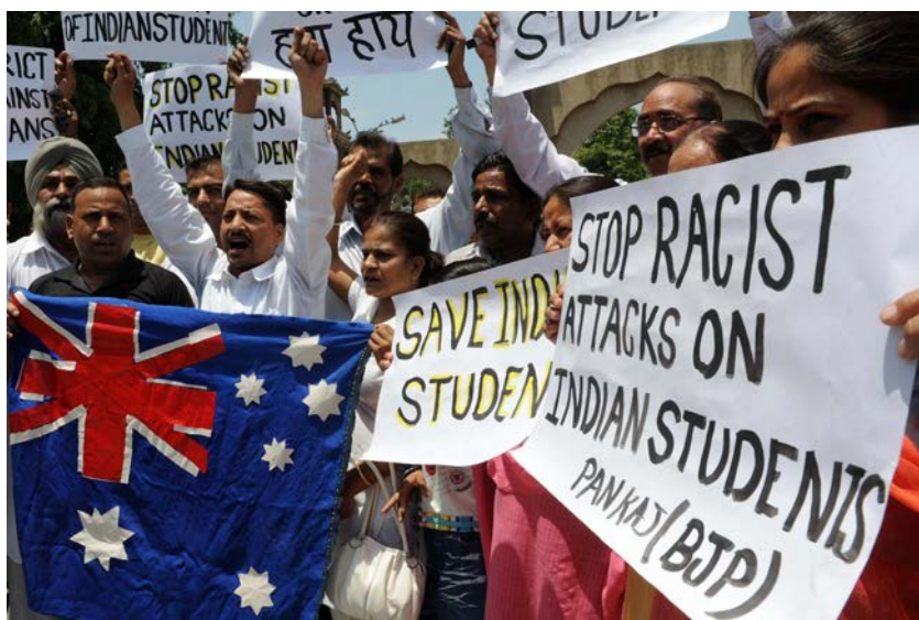
Activists from India's Bharatiya Janata Party (BJP) protest in Amritsar on 12 June 2009 against the treatment of Indian students in Australia.