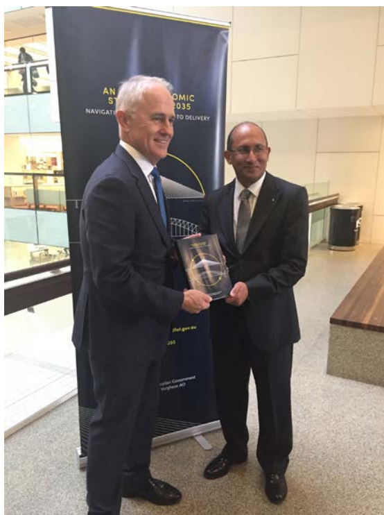
Prime Minister Malcolm Turnbull releases the India Economic Strategy 2035 by former DFAT Secretary and ex-High Commissioner to India, Peter Varghese.

to India was taken head-on by the government of Julia Gillard and resulted in a civilian nuclear agreement and greater cooperation in the fields of disarmament and non-proliferation between 2014 and 2017. The reversal of the White Australia policy was followed eventually by an influx of Indian immigrants to Australia, creating a strong social and cultural bridge between the two countries. 24 At the leadership level, every Indian and Australian government since those of Atal Bihari Vajpayee and John Howard has invested in steadily improved bilateral relations. As a result, economic and trade links grew rapidly during the 2000s, although they still fall short of expectations. Among other consequences have been increased Australian resource exports resulting in India becoming Australia's fifth-largest export destination; the success of Indian service industry providers in Australia; and a large number of Indian students coming to study in Australia. The Australian government's India Economic Strategy 2035, led by the former DFAT Secretary and ex-High Commissioner to India Peter Varghese, reflects the growing Australian ambition for deeper economic links with India. 25 Economic diversification away from China has become part of a conscious effort on the part of Australia's leadership, and India represents one major alternative. 26