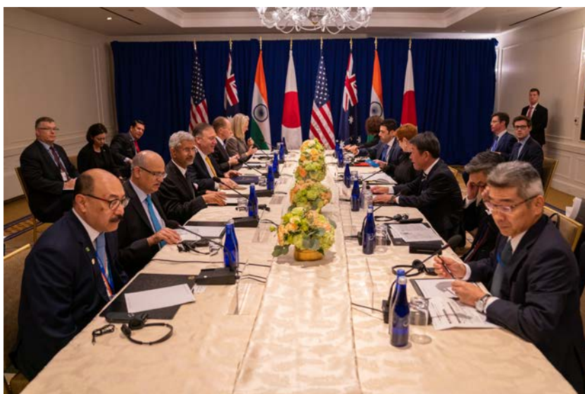
US Secretary of State Mike Pompeo hosts a Quad meeting with Australian Foreign Minister Marise Payne, Indian External Affairs Minister Subrahmanyam Jaishankar, and Japanese Foreign Minister Toshimitsu Motegi, at the Palace Hotel, New York, 26 September 2019.

engagement represents the growth of a complementary middle power-led strategic architecture that hedges against US retrenchment from the Indo-Pacific. In September 2020, an India-France-Australia dialogue was also initiated, involving three capable resident maritime states in the Indian Ocean, at the level of foreign secretaries. Both India and Australia also take part jointly, with occasional coordination, in a host of regional and global forums. These include IORA, the G20, and the ASEAN-led groups — the ASEAN Regional Forum (ARF), ASEAN Defence Ministers' Meeting Plus (ADMM-Plus), and the East Asia Summit (EAS). Newer, issue-based groupings involving both India and Australia have also emerged in 2020, including on 5G telecommunications, artificial intelligence, and supply chain resilience. The latter is an issue on which the governments of India and Australia, along with Japan, have taken a lead. 41