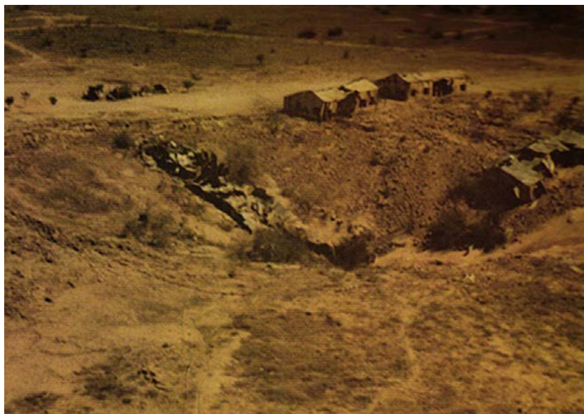
Site of the Pokhran II nuclear test (Operation Shakti) after the explosion on 11 May 1998.