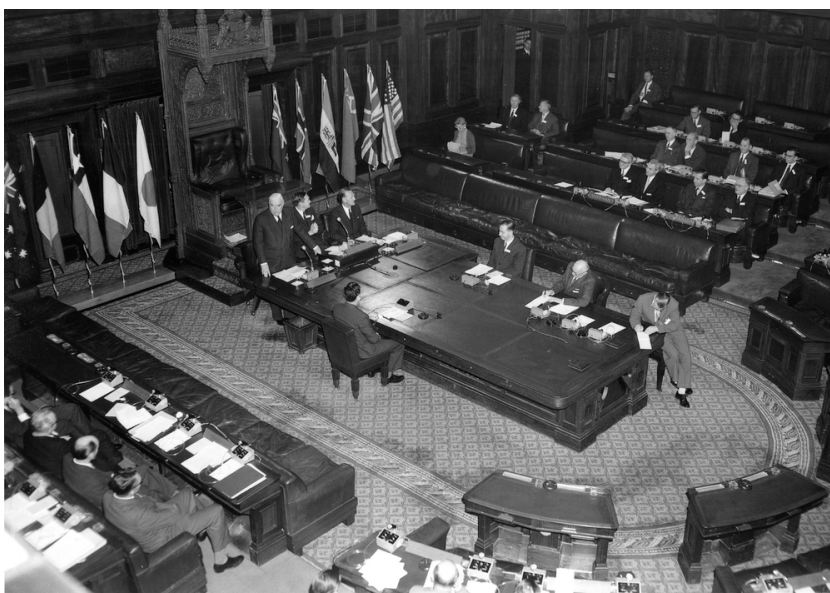
The first Antarctic Treaty Consultative Meeting (ATCM), Parliament House, Canberra, 10 July 1961, with Australian Prime Minister Robert Menzies at the podium.

Now is the time for us to reiterate the benefits of a functioning ATS for all member states: scientific status, practical understanding of changing global weather and currents, and an increasingly valuable sustainable fishery. As climate change and overfishing place increased pressure on all fish stocks, precautionary management of Antarctica's fisheries needs to be seen as preserving a resource for all CAMLR Convention signatories; not as a Western environmentalist luxury. All Treaty members, not just Australia, stand to lose if the ATS falls apart.