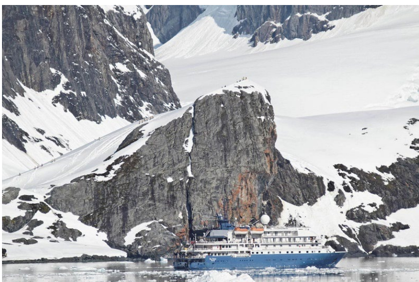
Tourism policy is essential for controlling access to one of the world's most remote regions. More than 56 000 tourists visited Antarctica in the 2018-2019 season.

Other potential groupings are the five states closest to Antarctica — Australia, New Zealand, South Africa, Argentina, and Chile — that host ‘jumping-off’ ports. Of these, Chile, 41 Argentina, 42 and South Africa 43 contend with Chinese fishing fleets in or near their waters beyond the geographic remit of the ATS. Consistent with our increasingly diverse work in the Quadrilateral Security Dialogue (with the United States, India, and Japan) we should work more closely with those countries. The US is already a close partner for Australia in the ATS, despite its non-recognition of our claim. 44