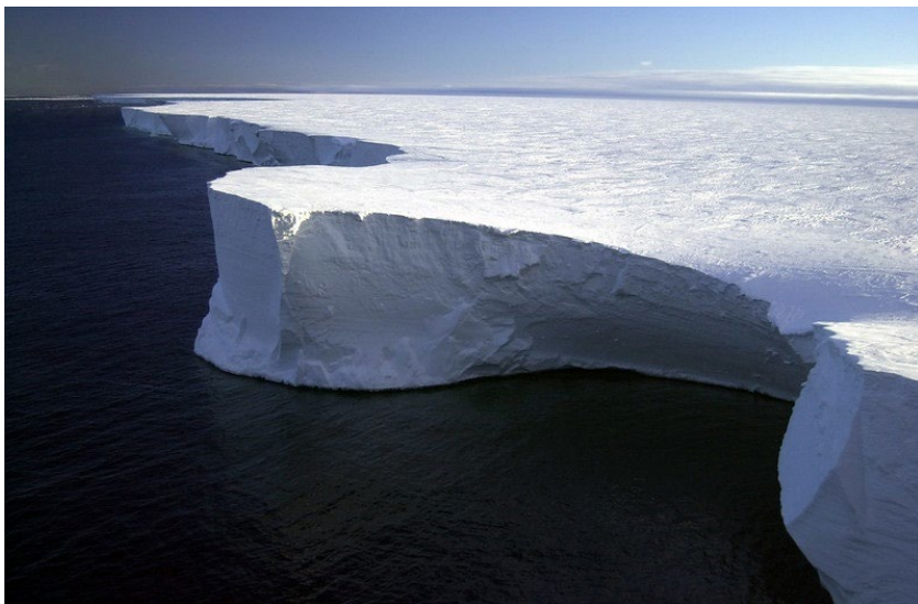
The northern edge of the giant iceberg, B-15A, in the Ross Sea, Antarctica. Researchers place global positioning systems (GPS), weather monitoring stations, and seismometers on icebergs to track their movements.

Our science should meet ATS ideals — particularly openness and relevance to all. The new Australian Antarctic Science Strategic Plan heads in the right direction, with an emphasis on global concerns of climate change, Antarctica’s impact on global weather, and the sustainability of marine living resources. 51