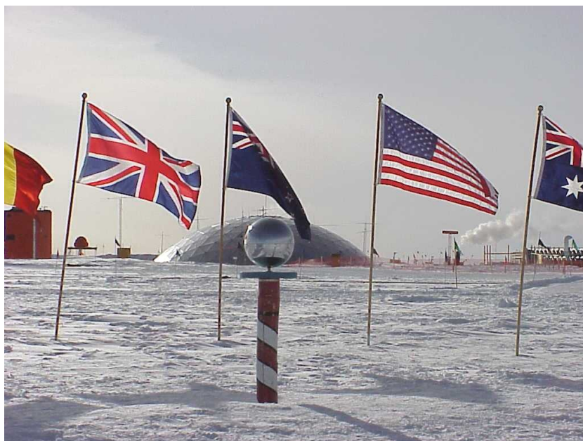
The ceremonial marker at the South Pole is surrounded by flags of the 12 original signatory nations of the Antarctic Treaty, signed on 1 December 1959 in Washington, DC.

To shore up its domestic rule, the Chinese Communist Party (CCP) needs to keep China's economy strong, secure technological leadership, and demonstrate China's power in global affairs. In Antarctica, that translates into growing exploitation of fisheries, Chinese ownership of tourism opportunities, access to Western technology through joint projects, and international acquiescence to China's preferences in the ATS. Before 2016, China's Antarctic stations and science seemed designed to position it for a territorial claim in the AAT if the Antarctic Treaty were overturned at some point in the future. 5