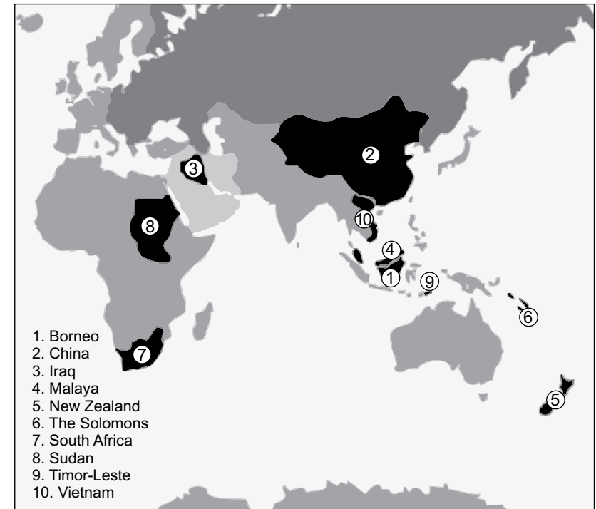
Figure 1: Map showing location of Australian counterinsurgency case studies

The nature of Australian involvement in these conflicts, however, helps account for the institutionalisation of tactical rather than strategic approaches to counterinsurgency. Australia's campaigns have, with one notable exception, been as the junior partner in a coalition. 85 This has meant that the prime requirement of Australian participation has been to provide troops rather than strategic ideas. The consequence of this abdication of strategy to an ally was, as observed by a previous Chief of the Australian Army, 'where the campaign did not go well, we tended to hide behind our belief that our part of the campaign went well.' 86 This trend is evident from the Australian effort in Phuoc Tuy Province in Vietnam through to the conduct of operations in Al Muthanna and Dhi Qar Provinces during the Iraq War. Australia's failure to develop a strategic approach to — and our junior coalition partner status in — such counterinsurgency campaigns appears to have offered an excuse to avoid the blame from any subsequent strategic failure, perceived or real. The trend of tactical rather than strategic contributions has carried into the present.